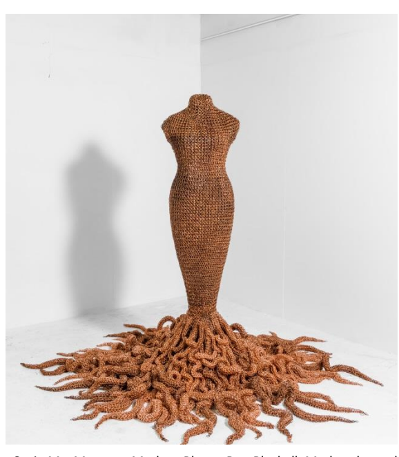
Susie MacMurray – Medusa Medusa loaned courtesy of Private Collection UK

MacMurray's exhibition promises to be an astounding collection of intricate and thought